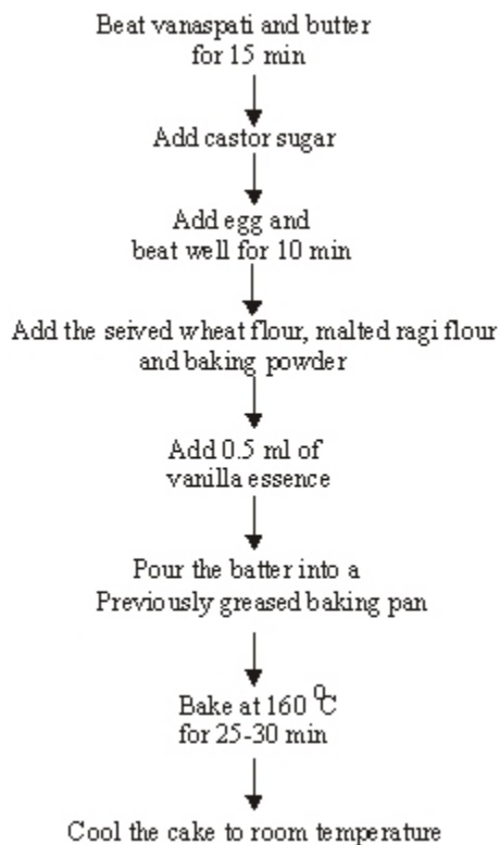
Fig. 2: Flow diagram for the preparation of cake supplemented with malted ragi flour

attributed to the enzymatic hydrolysis of starch by amylases and diastases, which degrade starch and produce glucose. This increased amount of glucose becomes the precursor of vitamin C (Taur et al. , 1984). It is reported that during malting process calcium and phosphorus content increases whereas iron content decreases (Sangita and Sarita, 2000).