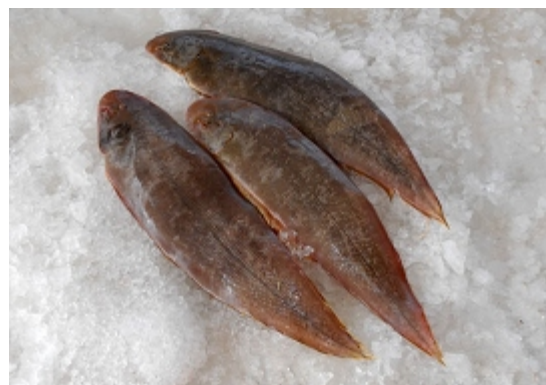
Plate 1. Dorsal view of Cynoglossus senegalensis

The flat tonguefish Cynoglossus senegalensis (Plate 1) belongs to the family, Cynoglossidae. This flat fish is distinguished by the presence of a long hook on the snout overhanging the mouth, and the absence of pectoral fins. Their eyes are both on the left side of their body, which also lacks a pelvic fin. They are found in tropical range (22°N-18°S, 18°W-14°E) and subtropical oceans, mainly in shallow waters and estuaries though a few species are also found in deep sea floors and rivers but distributed mainly in the Eastern Atlantic from Mauritania to Angola. Some species have been observed congregating around ponds of sulphur that pool up from beneath the seafloor on sand and mud bottoms of coastal waters. Scientists are not sure of the mechanism that allows the fish to survive and even thrive in such a hostile environment. They feed on mollusks, shrimps, crabs and fish and sold as frozen filet under the name filets de sole . C. senegalensis are demersal, brackish, marine fish living in the depth range of 10-110 m. The fishery of the flat fish is highly commercial and marketed fresh, smoked or dried. Apart from being a cheap source of highly nutritive