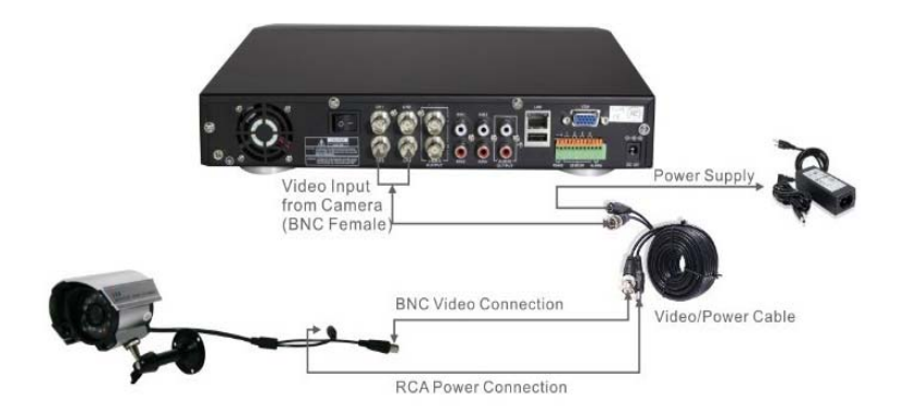
Fig. 1: Simple CCTV with Wire System (Kim, 2009)