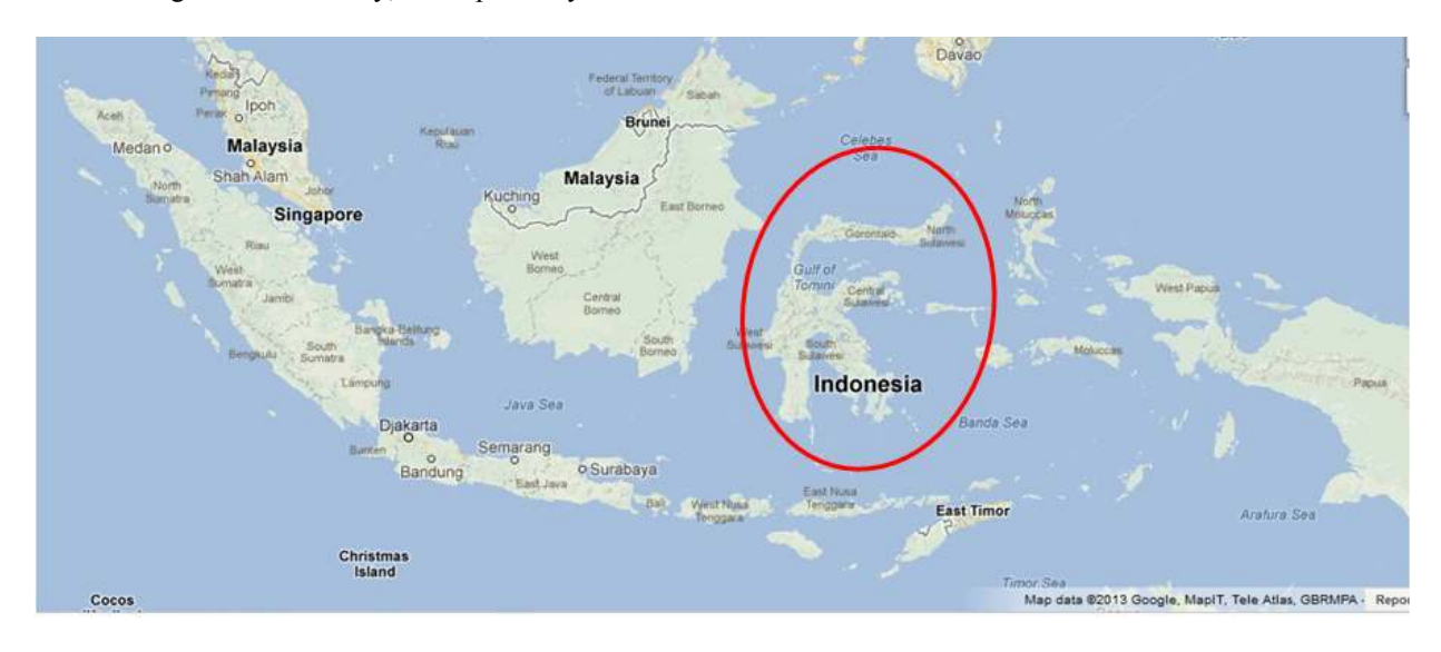
Fig. 1: Sulawesi Island

Sulawesi of the Republic of Indonesia. It can be reached by boat within approximately 30-45 min. Around the island, there is the Bunaken Marine Park which is part of the Bunaken National Park. There are two villages on this island, namely Bunaken with 2,844 inhabitants, which consists of 528 families and Alung Banua with 707 inhabitants from 160 families. Most of them live of farming during the rainy season and