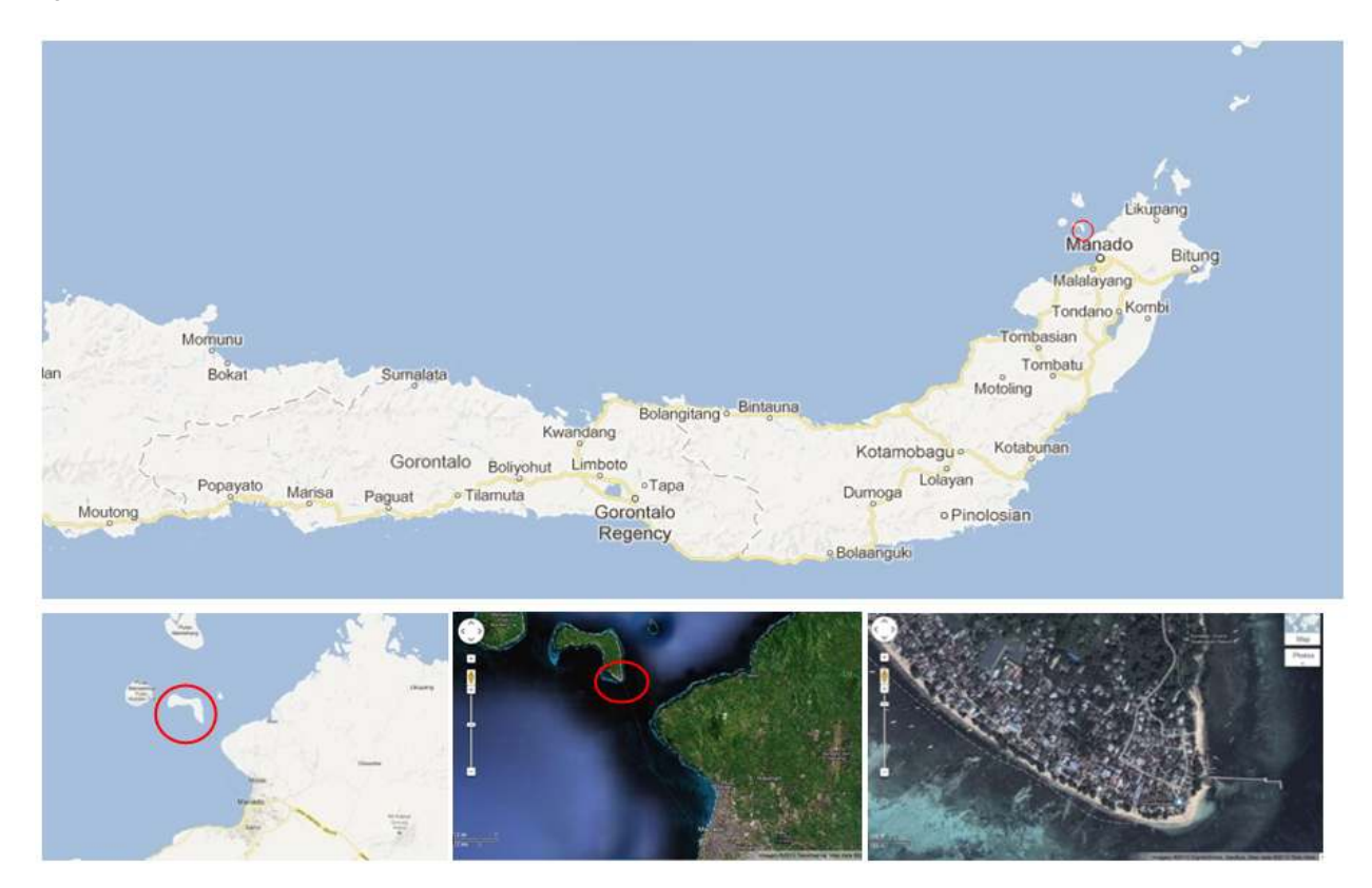
Fig. 2: Bunaken Island and location of Bunaken village