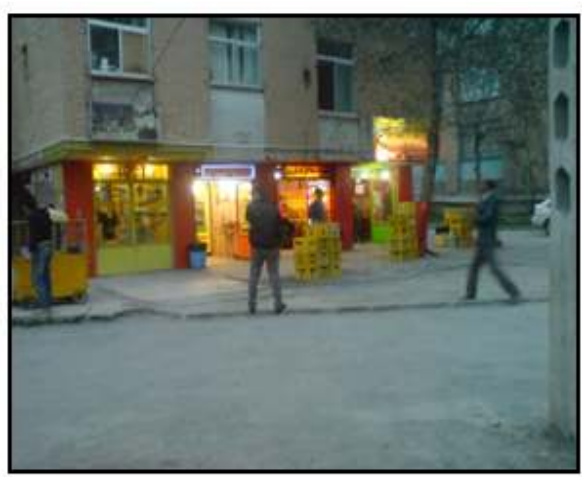
Fig. 2: Situation of Abadanian Residential complex in hamedan City and its Shopping center (Authors)