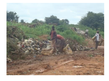
Fig. 13: Scavengers collecting recyclable items from tipped waste at Gosa landfill