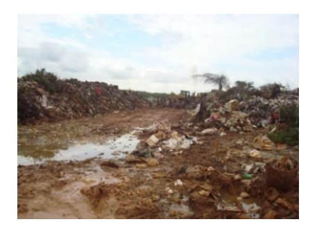
Fig. 9: Access road into main landfill dumpsite

Currently waste segregation and recycling is not practiced in FCT Abuja by AEPB (2012). Segregation