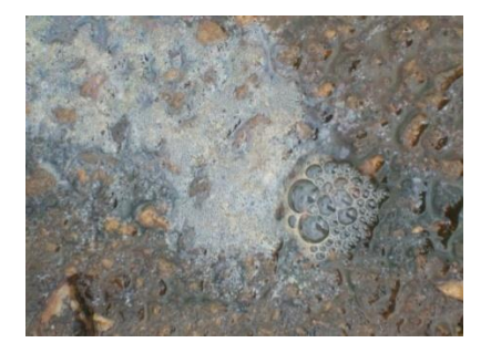
Fig. 7: Methane bubbles from the seeping leachate

One of the major issues in municipal waste management in the FCT Abuja is the high volume of non-degradable fractions; polyethylene as shown in Fig. 8 even after 13 years of burial the polyethylene waste are same as the day initially buried. The cost of recycling polyethylene is higher than the cost of