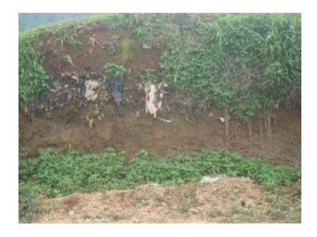
Fig. 8: Polyethylene buried 13 years ago in Mpape landfill

producing new polyethylene which makes it nonprofitable to consider recycling. The manufactures have a high preference for polyethylene as such use it mostly for the packaging of their products, which are in high demand such as drinks, water and other food product. The use of glass bottles which are usually recycled and reused by the manufacturing companies is being phases out. As such currently this has been a source of great concern because of the high volume of polyethylene ending up in the landfill.