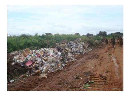
Fig. 11: Indiscriminate tipping along landfill road