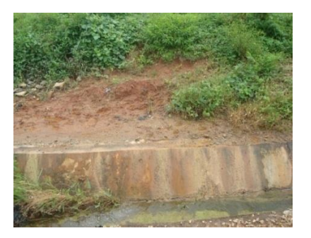
Fig. 6: Leachate seeping to the top soil