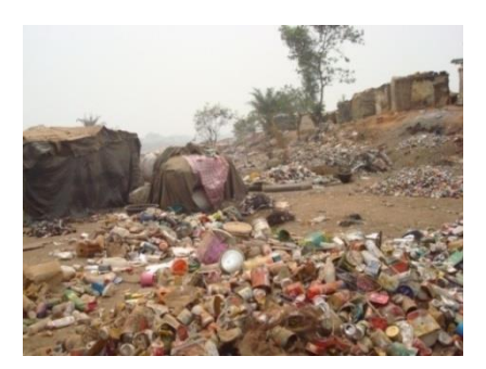
Fig. 14: Collection of recyclable item by scavengers within Gosa landfill

Fig. 13: Scavengers collecting recyclable items from tipped waste at Gosa landfill