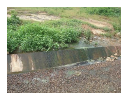
Fig. 5: Leachate seeping from the covered ground