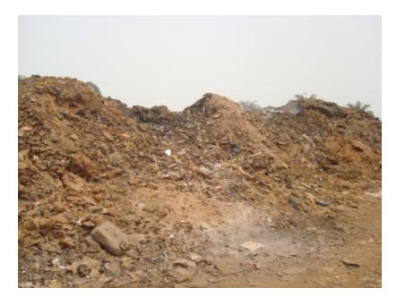
Fig. 10: Gosa landfill