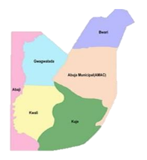
Fig. 1: Map of FCT Abuja showing area councils

Study area: The Federal Capital Territory; FCT Abuja is the current capital of Nigeria the previous capital was Lagos. The Federal Capital was established in 1976, due to so many problems such as over population, congestion, space limitations, waste management and other related environmental issues. The FCT Abuja was a pre-planned city consisting of six area councils; AMAC, Bwari, Gwagwalada, Kuje, Kwali and Abaji as shown in Fig. 1. The area councils can further be subdivided into districts. FCT Abuja has a land area of 7,753.9 km/sq., with a population of 1,406,239 (NPC, 2012). A master plan for Abuja was designed to avoid