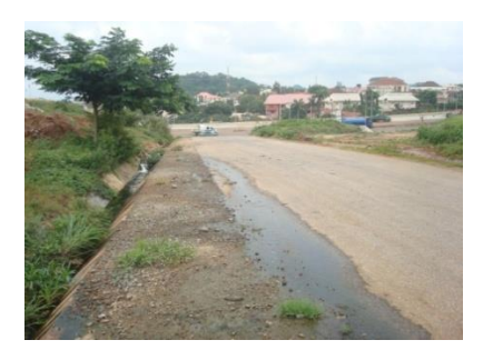
Fig. 4: Residential housing near Mpape landfill

The Mpape landfill was not an engineered landfill and in 2005 it was closed using intermediate soil cover, grasses where planted to reduce runoff and infiltration. There are explosions from the trapped methane gas specifically during the dry season, leachate seeping from the closed landfill on to the surface and methane emission to the surface from the closed landfill, as shown in Fig. 4, 5, 6 and 7. The landfill is up slope with residential housing 200 m down slope and one of the major issues of concern is the contamination of the ground water within the residential areas near to the landfill. Since boreholes are the major domestic water source within that specific area and generally within the FCT Abuja. The boreholes have not been tested to confirm contamination. The leachate has been sent to a laboratory in Germany by AEPB to test which major contaminants are in the leachate. Copper and mercury have been found to be of high concentration in the leachate. All these issued from the improper operated and closed landfill pose environment hazard, human health hazard and even physical hazard from the methane gas that has a high potential to travel laterally with residential houses in close proximity as shown in Fig. 4.