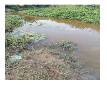
Fig. 1: A stream serving as a source of water in Akutuase

Review of water, unsafe water and ceramic filters: According to Annan (2016), over 70% of an earth surface is known to be covered with water. The essential issue is that there is a proportion of fresh water available for safe drinking. Surface waters are often contaminated and required specialized filters to make them safe for drinking. Again, surface water continues to dry up mainly due to the adverse climatic conditions. The available ones are also often contaminated with either chemicals or microbial agents that are detrimental to the health of an individual and therefore not safe to drink (Annan, 2016). Water is unsafe when it contains worms, germs, or toxic chemicals. Toxic pollution in water is as a result of agriculture, mining, oil drilling and many other industries chemical wastes dump into water sources. This makes the water unsafe to drink or to use for preparing food, for bathing, or irrigation (Conant and Fadem, 2012). Although most microorganisms in a water are harmless, some can cause problems. Bacteria from human or livestock waste can cause serious health problems such as