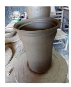
Fig. 12: Sample of smooth pressed clay filter ready for drying