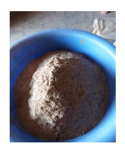
Fig. 6: Processed sawdust from Akutuase