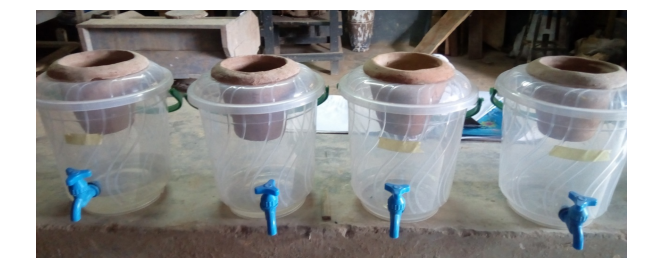
Fig. 16: Levels of filtered water after 1 h in fired clay filters (C_1 \text{ to } C_4)

Water samples were fetched from a stream in Akutuase (Fig. 13) by employing purposeful sampling technique. The contaminated water was stored in cleaned sterile plastic containers (Fig. 14).