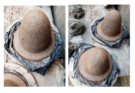
Fig. 11: Samples of pressed clay filters