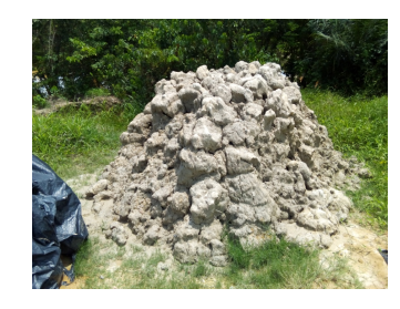
Fig. 3: Clay mined near a stream in Akutuase