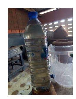
Fig. 14: Contaminated water