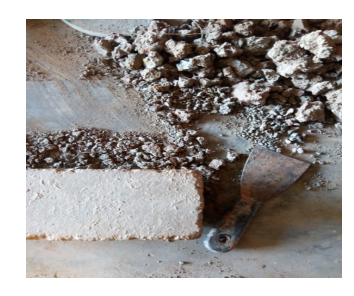
Fig. 5: Processed clay from Akutuase