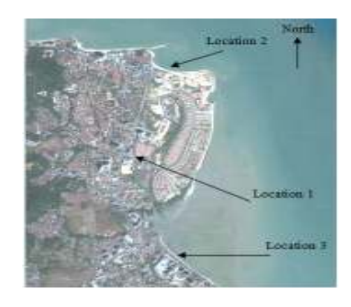
Fig. 1: Sampling locations

Samples collection and preservation: The water samples from each location are collected using 20 L bottles and stored inside cool room at temperature of