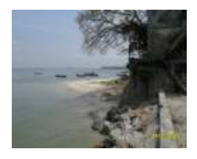
Fig. 3: Location 2-north of Tg. Tokong