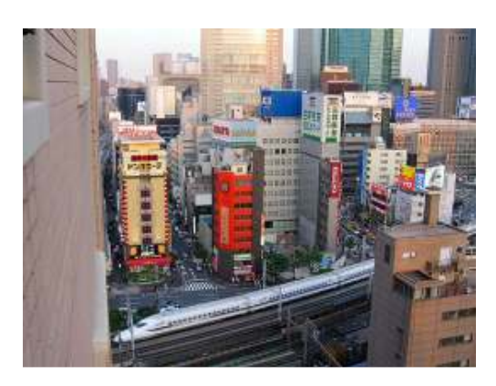
Fig. 3: Transportation in Curitiba, Brazil

2008). Figure 3 is a sample of transportation in sustainable town in Brazil.