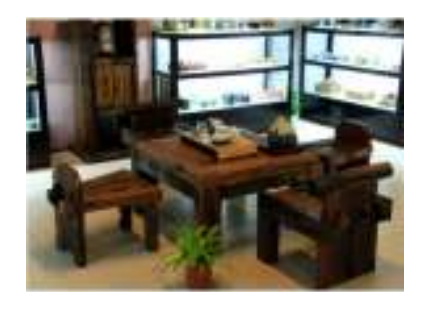
Fig. 1: Old ship-wood furniture