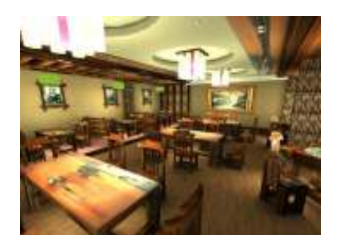
Fig. 4: Old ship-wood dining room furniture

centuries in the process of wooden ship traveling, the texture of which becomes clear and hearty, the structure of which becomes natural and plain but tough to wear and which has other properties, such as natural waterproofing, pest control, anti-corrosion and so on. Its manufacture is mainly by hand, which not only reduces energy consumption, but also greatly reduces emissions of carbon dioxide and other gases to fully reflect the good green features. Using old ship wood to make furniture, to some extent, alleviate the supply and demand contradiction of solid wood to make the furniture. At the same time the old ship-wood which is a product of nature, with biological angry and spirituality, become the ties to maintain the sustainable development of "Human-Machine-Environment" after people careful picking and processing. Therefore, the old ship-wood furniture is green and unique original ecological and the green environmental protection is one of its core charms. For example, Old ship wood yard furniture (Fig. 3), Old ship-wood Dining room Furniture (Fig. 4).