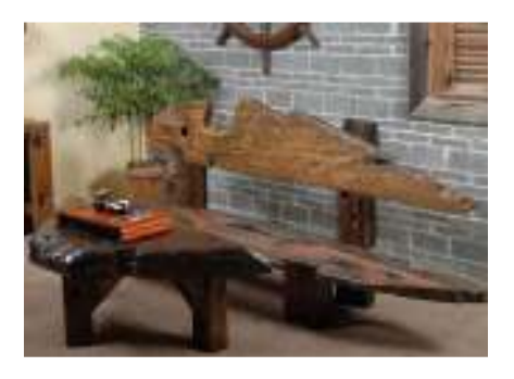
Fig. 3: Old ship-wood yard furniture

Green environmental protection: Materials are the material foundations to implement the functions of the products. Using green materials to design furniture has played a decisive role in the pursuit of environmental protection in today. The materials of the old ship-wood furniture come from the abandoned old wooden ship, through seawater immersion, scouring of waves and exposure in the hot sun for the decades or even