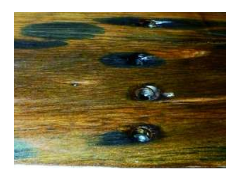
Fig. 6: Unique rivet holes

high value-added old ship-wood furniture through designer's clever conception. It not only keeps in line with the trend of green, but also responds to national initiatives to vigorously promote to construct the "resource-saving, environment-friendly "society and to turn waste into treasure.