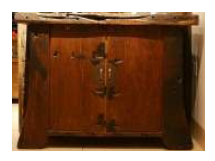
Fig. 9: Copper decorations