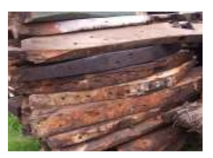
Fig. 8: Classification of the old ship-wood

elm, Merbau, iron Lei, etc. (Fig. 7). The election process of materials for Old ship-wood furniture is complex and exploratory. In the selection process, paying particular attention to observe the morphology of the old ship-wood and conceiving the possible shape characteristics of the old ship-wood furniture so as to the material classification (Fig. 8). After the accomplishment of the materials election, there is no need for anti-corrosion, pest control and other protective treatment. It is only to simply deal with the rivets so that they couldn't damage manufacture cutting tools in the process of Old ship-wood furniture manufacture.