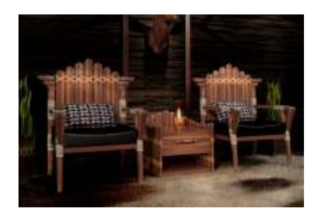
Fig. 10: The structure tied up with strings