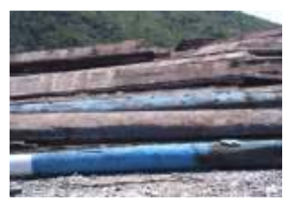
Fig. 7: Logs dismantled from the ship

Choice of materials: The wooden ships can withstand the erosion from the sea and the sea breeze for dozens or even centuries, which have great relationships with materials. Used for large ships, there are many highquality species, which mostly have high density and hardness, including Queensland Austin, Tokyo, teak,