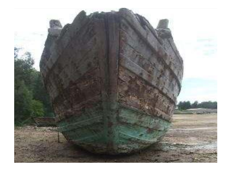
Fig. 2: Abandoned old wooden Ship

support of the State Science and Technology Commission, the National Natural Science Foundation and other relevant departments conduct a wide range of researches and explorations on green design and manufacture. And the green furniture related researches have been made many achievements, but still cannot meet the needs of green furniture. The green old shipwood furniture (Fig. 1) is made up of wood materials dismantled down from the discarded old wooden boat (Fig. 2) by simple processing. Its properties of excellent environmental protection, unique original ecology and elegant artistry fit the modern pursuit of the natural way and the concept of life, which is a single show of folk furniture. Therefore, the systematic study on the old ship wood furniture based on the perspective of the Green Environmental Protection can draw people's attention to promote the old ship-wood applied in the field of furniture design and manufacturing, which will ultimately drive forward the development of green furniture.