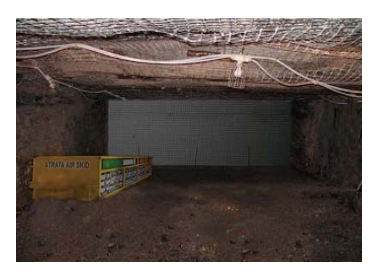
Fig. 2: Arrangement of temporary refuge chamber

• Number of refugees in chamber should be decided generally speaking in consideration of affluence coefficient as well as laneway arrangement in mining area and distribution of operating personnel