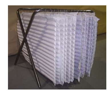
Fig. 4: Absorption curtain used for carbon dioxide

absorbing curtain as shown in Fig. 4. Disadvantages: expensive in price and excessive heat in reaction process. To sum up above absorbents, we should give preference to soda lime as a carbon dioxide absorbent while the super (hyper) oxide and anhydrous lithium hydrate as a spare absorbent when the chamber is equipped with power source and refrigeration equipment.