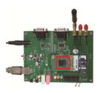
Fig. 2: The sensor end in security system

the mutual authentication, signature and signature verification, encryption and decryption.