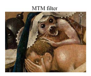
Fig. 4: Cracks filled image using

Finally Using MTM (Modified Trimmed Mean) filter to fill the cracked images and to get the final image finally we calculate the PSNR value of the processed image with the original image with structuring element is as follows (Fig. 3 and 4) (Table 1).