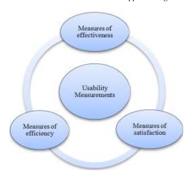
Fig. 2: The major usability measurement criteria

products, this usability has many attributes that must be taken when developing any application and specially for developing mobile applications (Fig. 1), these attributes are Efficiency, Satisfaction, Effectiveness, Learnability and Errorless, all of these attributes have strong impact on usability of mobile applications.