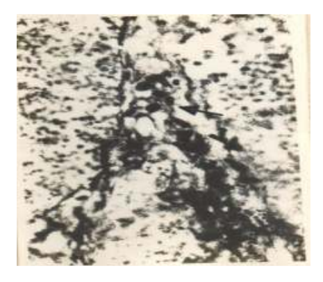
Fig. 3: Showing lobules having all the categories of interstitial cells with the dominance of category II (→), category I (→), category III (- - -►) are also present which show hypotrophy and hypolasia. (18L: 6D×40)