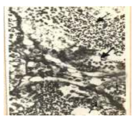
Fig. 1: Showing interstitial cells with the dominance of category I (→), Category II (→) and category III (- - - - ▶). (Control×40)

The testes of H. fossilis shows an uniform tempo of spermatogenesis throughout the year. However, an increased rate of spermatogenesis has been recorded in those months which correspond with the active phase of female fish. These observations in the present study have been confirmed from the quantitative studies of these interstitial cells.