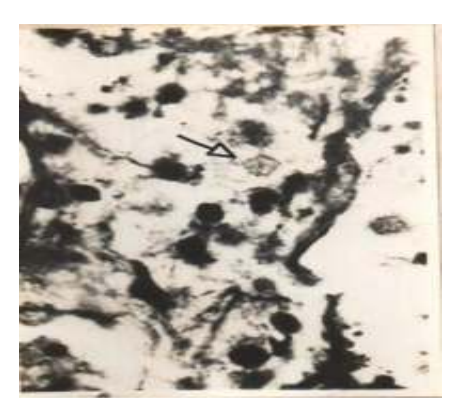
Fig. 4: Showing degranulated and vacuolated pycnotic interstitial cells (\rightarrow) . (18L: 6D×40)

Fig. 3: Showing lobules having all the categories of interstitial cells with the dominance of category II (→), category I (→), category III (- - -►) are also present which show hypotrophy and hypolasia. (18L: 6D×40)