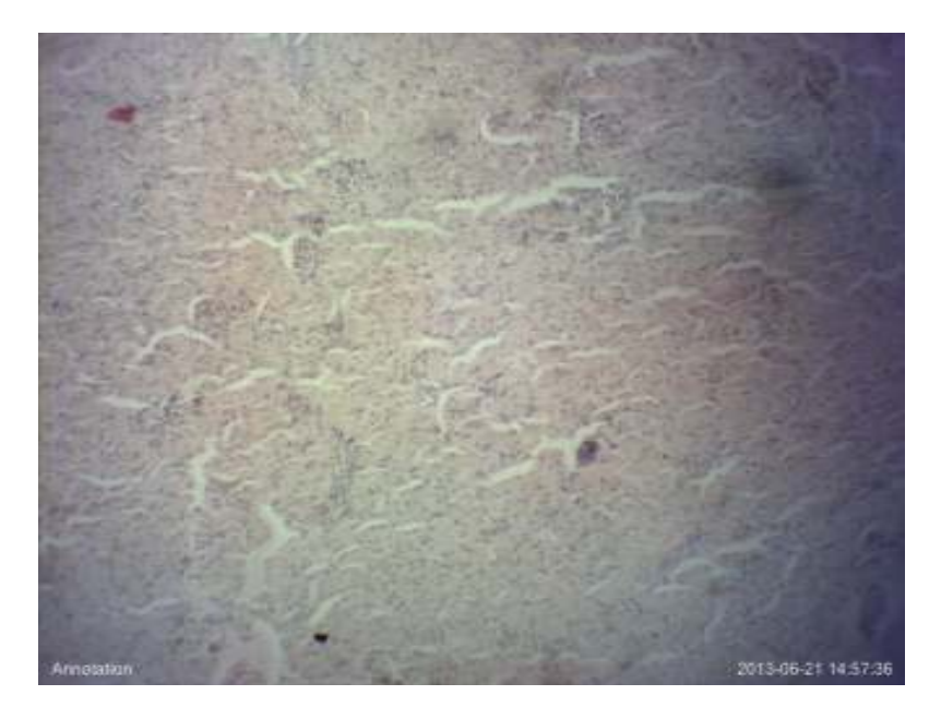
Fig. 2: Cross section of diabetic kidney stained with H & E, Mag: ×400