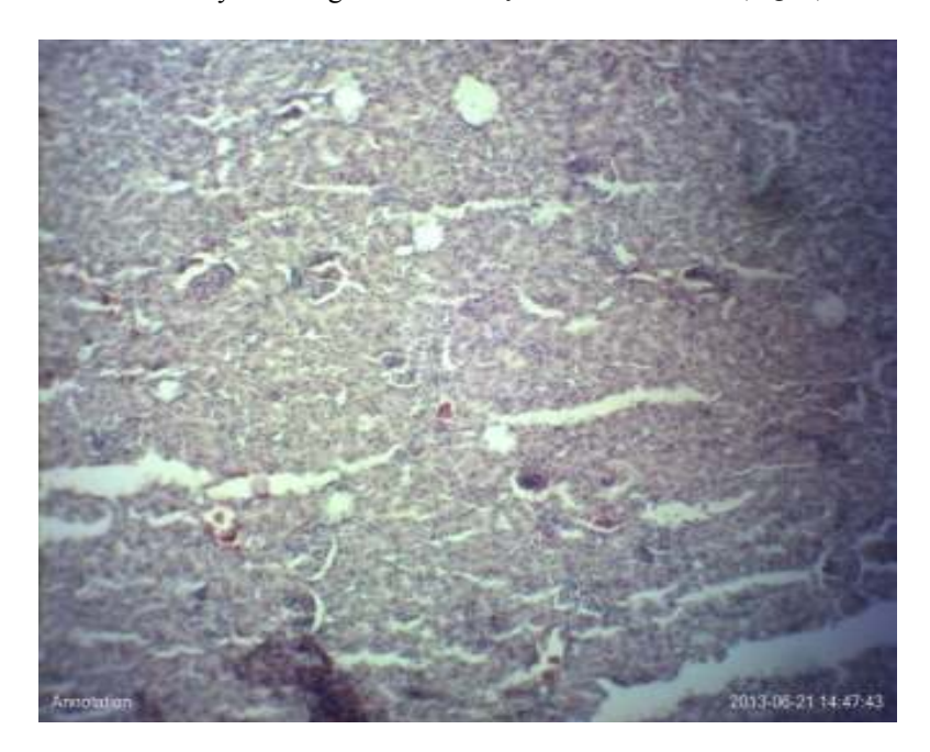
Fig. 1: Cross section of normal kidney stained with H & E, Mag: ×400

tubular brushborders and intact glomeruli and Bowman's capsule (Fig. 1), Diabetic untreated group showed severe tubular necrosis and degeneration is shown in the renal tissue (Fig. 2). Diabetic group treated with glibenclamide (10 mg/kg body weight) showed normal tubular pattern with a mild degree of swelling, necrosis and degranulation (Fig. 3). Diabetic group treated with the ethanolic roots extract of Pseudocedrela kotschyi (500 mg/kg body weight) attenuated the toxic manifestations in the kidney caused by alloxan induction (Fig. 4).