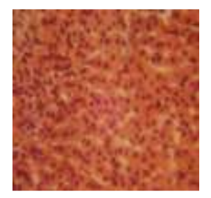
Fig. 4: Histology of the liver tissue of rabbit treated concomitantly with Chloroquine and Aqueous extract of A. indica orally. Shows the sinusoidals cells to be normal. Mag. X400 (H&E)

Fig. 3: Histology of the liver tissue of Rabbit (control animals) treated orally with chloroquine sulphate. Shows normal liver architecture with normal sinusoidal cells. X400 (H&E)