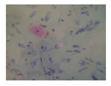
Fig. 3: Photomicrograph showing a section of prefixed, air dried cervical smeared sample. Note the clear background, few RBC's and well outlined epithelial cells with well outlined nuclei. Papanicolaou stain X 400