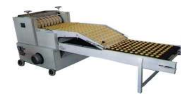
Fig. 2: Walnut cake biscuit forming machine

king, "change" as assist and the line type has to be simple and generous, giving person with comfort, coordination and felling of dynamic in quiet.