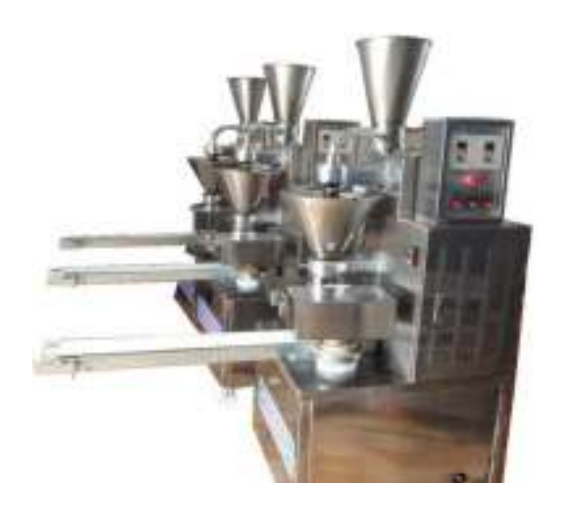
Fig. 1: Food machinery